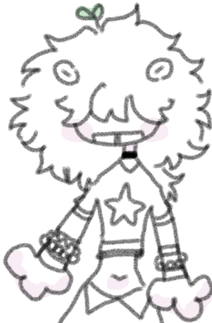
猫の食卓 by Kikuo (its goofy)